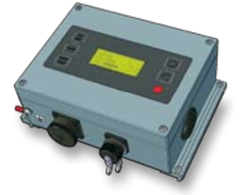
Remote control unit with ethernet communication