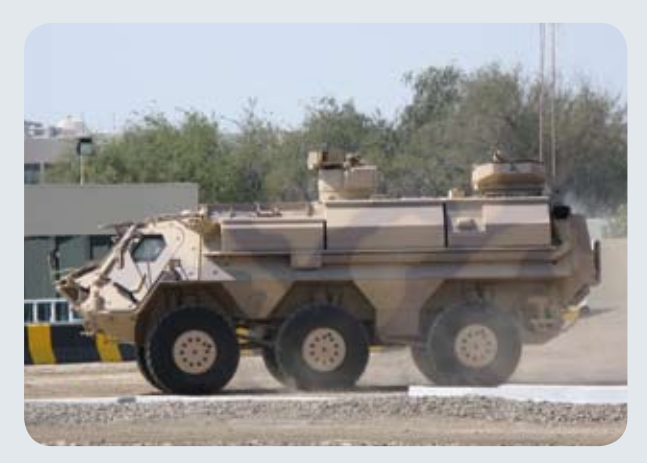
RAID-S2 will be installed at the Fox vehicle for filter monitoring