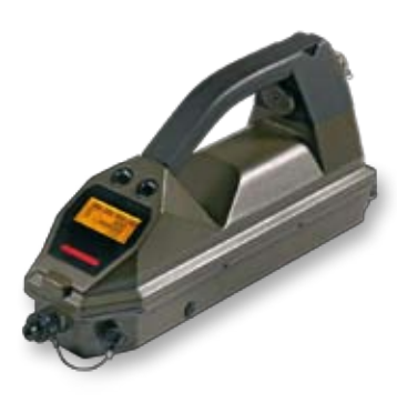
RAID-M 100 Hand-held chemical agent monitor