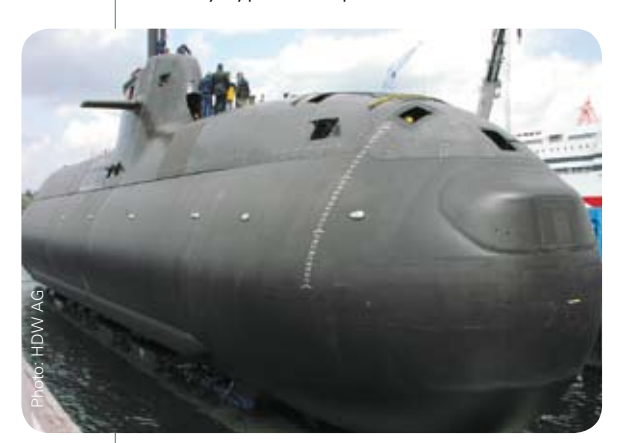
NC detection system operating on submarines such as the U31

The Radiation meter SVG2 upgrades the C-detection system to a Nuclear and Chemical Detection System (NCDS). All NCDS components are monitored by the NC Monitoring software. Furthermore the instruments can be integrated into a shipboard control and managing system on any type of ship.