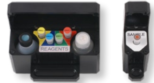
Closable sample and reagent holder for safe handling

capture of corresponding toxins from an applied liquid sample. Detection of captured toxins is realized by measuring the electrical current of an enzymatic redox reaction. The current correlates to the amount of target molecules bound to the specific antibodies. The whole identification procedure is realized in less than 25 minutes.